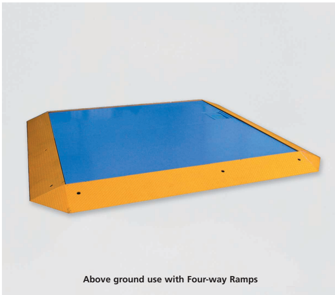
Above ground use with Four-way Ramps